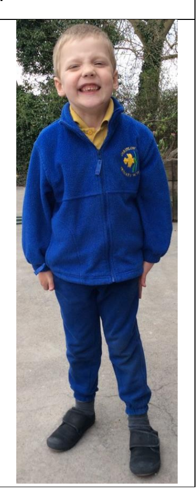
Examples of 'Everyday' School Uniform – Year 6