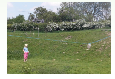
Active learning Being involved and concentrating Keeping on trying Enjoying achieving what they set out to do

If you dig deep enough then you might go right through the planet Earth - but before you get there you would have to get through the centre of the Earth and that would be like a volcano.